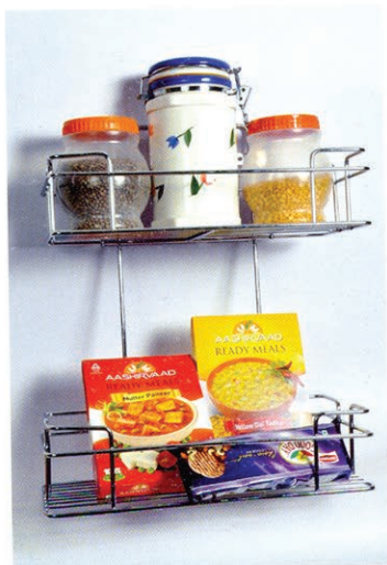
DOUBLE SHELF RACK