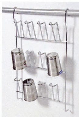
HANGING GLASS HOLDER