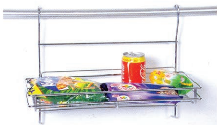
HANGING MULTI PURPOSE RACK (1 SHELF)