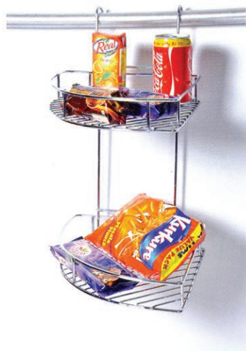
HANGING CORNER (2 SHELF)