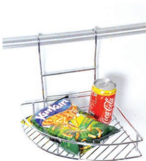
HANGING CORNER (1 SHELF)