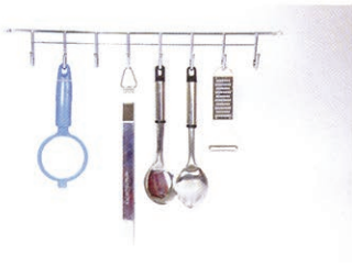
ELITE LADLE CRADLE (16")